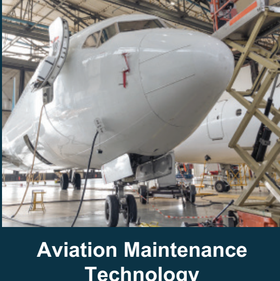
Aviation Maintenance Technology