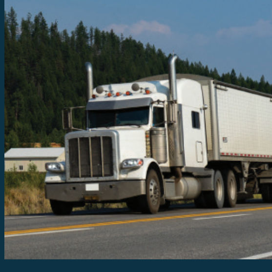
Class "A" CDL